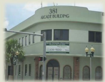
LJR Partners, LLC 377-381 North Krome Avenue