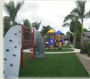
Ernestine Jackson Seymour Municipal Park