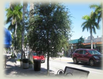
Krome Avenue Improvements