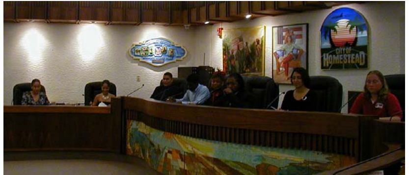
MYC candidates did a great job during Q&A forum on Election Night!