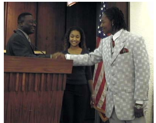
Oath of Office October 18th

MYC meets again on Monday, November 8th at 7:00 p.m. in the City Council Chambers