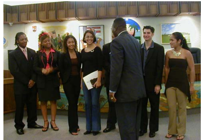
Mayor Warren extends congratulations on Election Night, October 11th