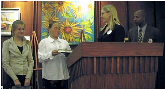
Congratulations! New members receive their certificates of membership at the October 18th City Council Meeting