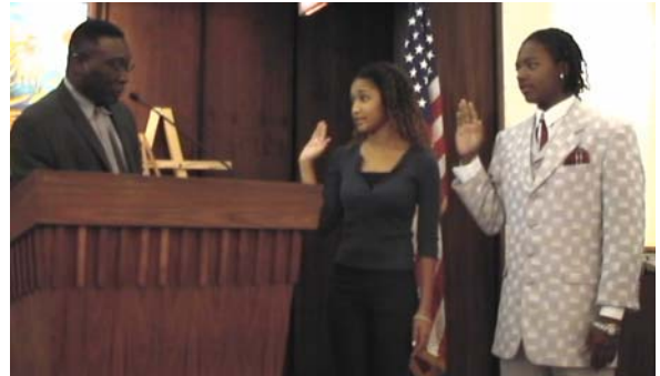
MYC Mayor and Vice-Mayor