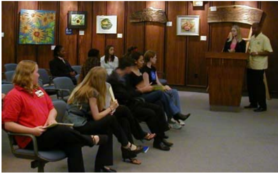
Election night October 11th.