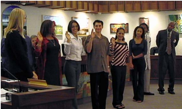
MYC Council Members