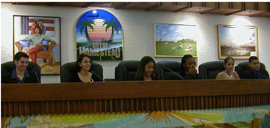
May I have a motion please?