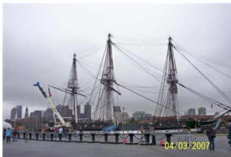
Left & below: MYC toured U.S.S. Constitution .