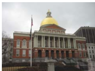
The State House In Boston