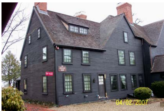
Hawthorne's House of the 7 Gables