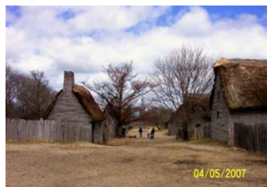
Above & Right: Pilgrim Visit in Plymouth