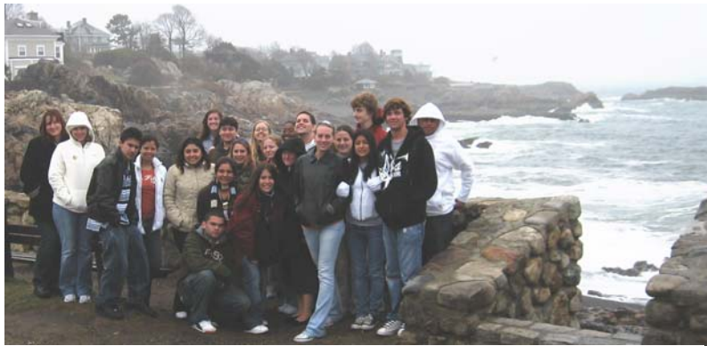
Scenic Bluff in Salem - The group was chilly but smiling!