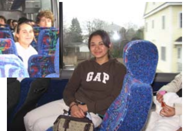
The heated tour bus got them where they needed to go.