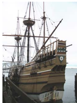
The Mayflower II